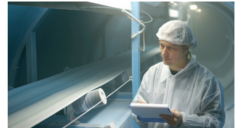
Smooth running, flexible for trough

In addition to the necessary Food Grade standards Ammeraal Beltech, thanks to R&D, develop materials and belting manufacturing methods useful to comply with the most rigid industry standards as Abrasion Resistance, Flame Retardant, Anti-Static, ATEX to work out a FIRST OF CLASS belt.