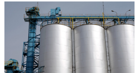
Our ATEX belts are suitable for potentially explosive atmospheres