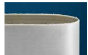
Leading competitor's equivalent belt

*results obtained after identical laboratory tests