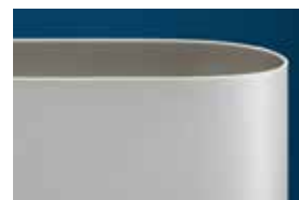
Ammeraal Beltech non-fray belt