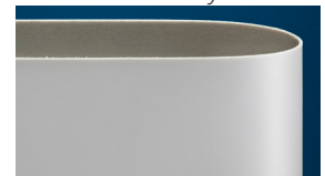
Premium Plus Belt

Fraying / durability test results obtained after identical laboratory tests: