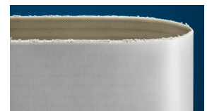
Leading competitor's equivalent belt